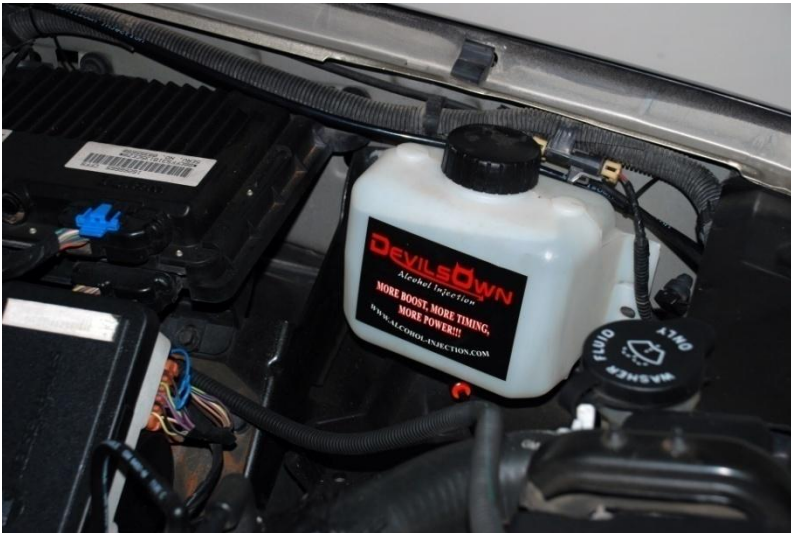
Figure 1: Tank Placement

Remove the factory washer fluid tank from the car, if possible, for ease of access. On a flat side of the tank, locate a place for the self sealing bulkhead fitting that is free of obstructions. (The best and recommended spot is either the side or the front of the tank.) Using a 7/8" drill bit, drill a hole in a flat location and simply place it in and hand tighten. In order to maintain a leak-free seal, this must be done on a flat area. DO NOT place the tank tap in the seam line of the tank. Doing so can cause leaks.