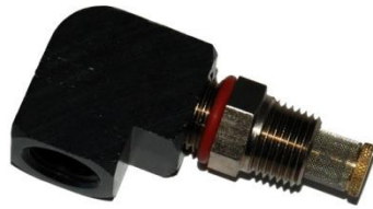
Figure 3: Nozzle mounted into nozzle holder