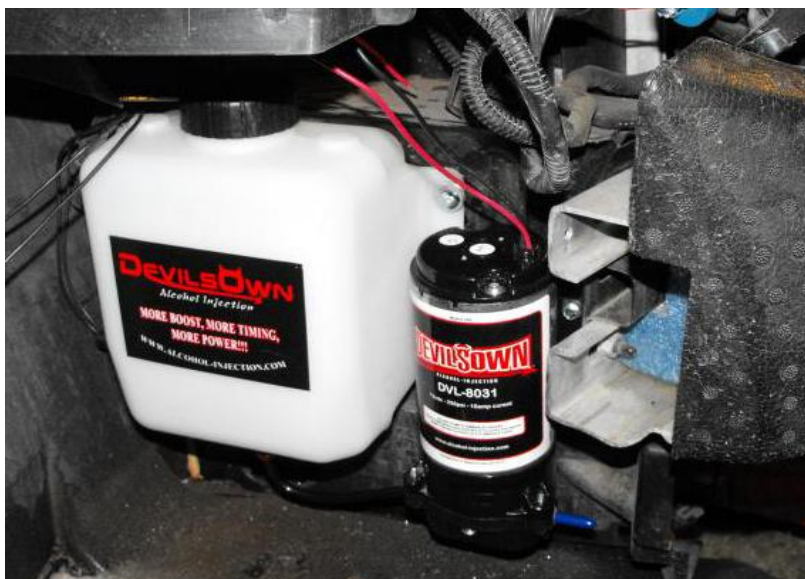
Figure 2: Pump placement

The DevilsOwn pump should be mounted below and as close to the reservoir (tank) as possible using four of the #10 x 1½" screws. Make sure to mount the pump away from heat, moisture and road debris. Because the pump will work at any angle, installation angle does not matter. Notice on top of the black pump housing, there are two arrows indicating the direction of fluid flow to and from the pump. The port with an arrow pointing towards the pump housing is the pump inlet (suction). This is the line coming from the reservoir tank. The port with an arrow pointing away from the pump housing is the pump outlet (pressure). This is the line going to the check valve or optional solenoid.